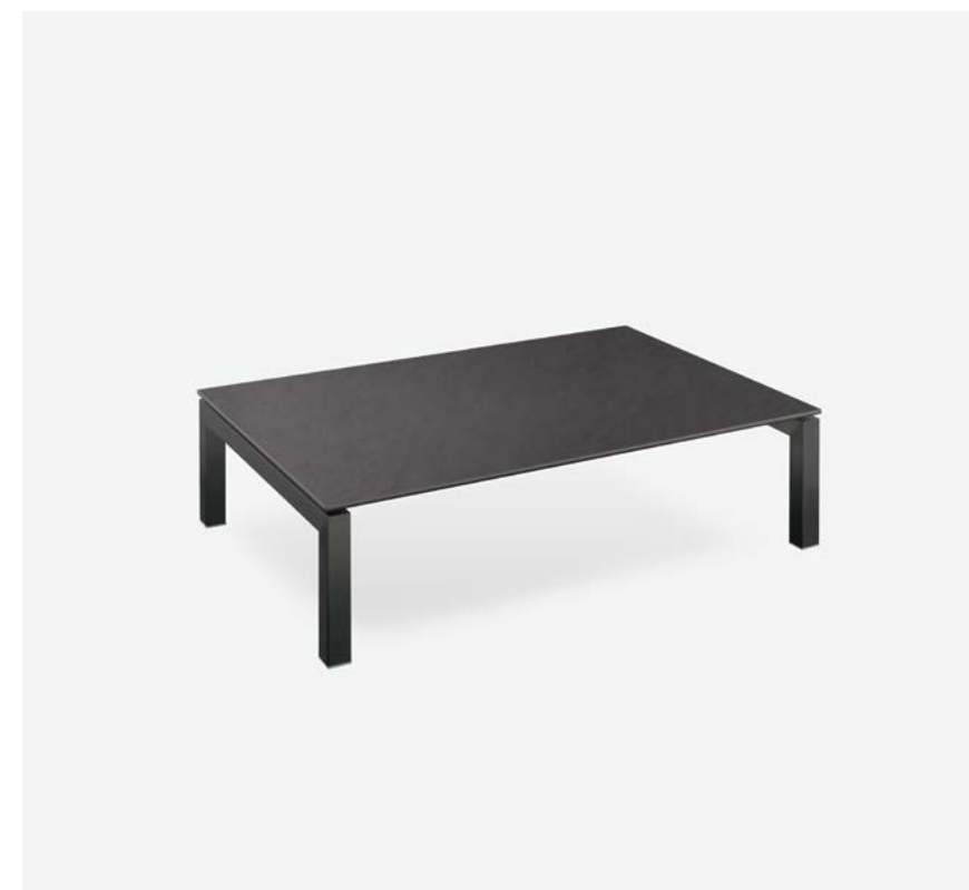
Coffee table (height 40). Its structure and also the metallic elements which form it have been made of stainless steel. Table top made of ceramic laminated with glass.