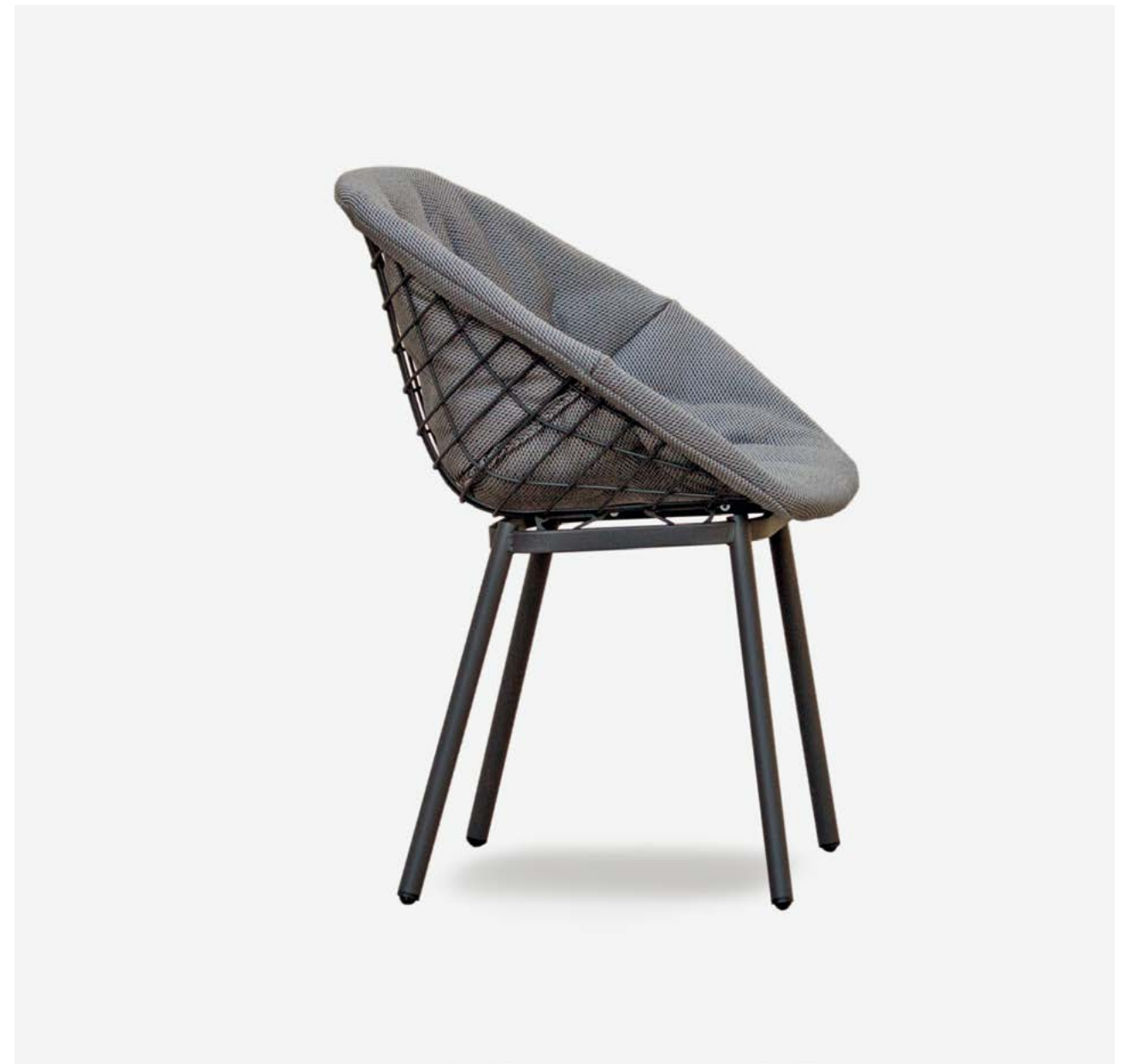
Chair with cover

The upholstery of the Canasta chair follows the shape of the shell structure like a skin, adding elegance and sensuality to the product.